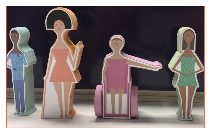
Figure 6. Mobile Access toy figures. (Morgan Cook)

living, but also serving didactic and exhibition purposes. Fun, exciting, and mobile, these units can travel far and wide, meeting a wide array of audiences wherever they are. The project, which also included development of a set of collectibles and a toy house, was ostensibly about discrete domestic spaces, but also proposed a strategic broadcasting of innovative ideas about accessible design to as vast and varied an audience as possible. It is notable to the thesis of the studio that Cook's project was chosen by visiting reviewers to reresent the All Access studio in the competition for studio thesis prize,