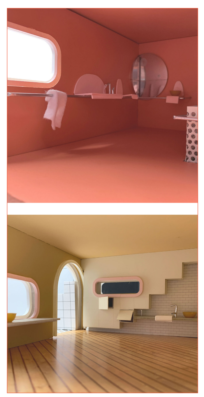
Figure 4. Action Figures as...An Addition. (Brian Baksa)

Brian Baksa's "ADA Hacks" were developed and deployed to site-specific situations and contexts: He proposed better fits through