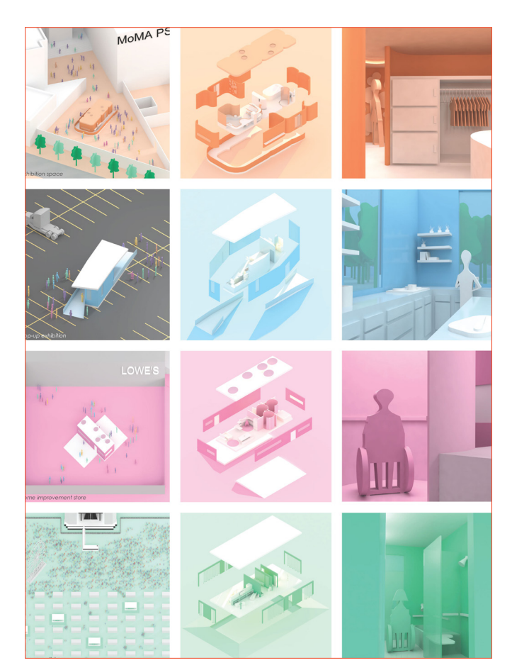
Figure 5. Mobile Access - taxonomy. (Morgan Cook)

Morgan Cook proposed a "Mobile Access" system of movable dwellings that could address numerous disabilities and needs. For