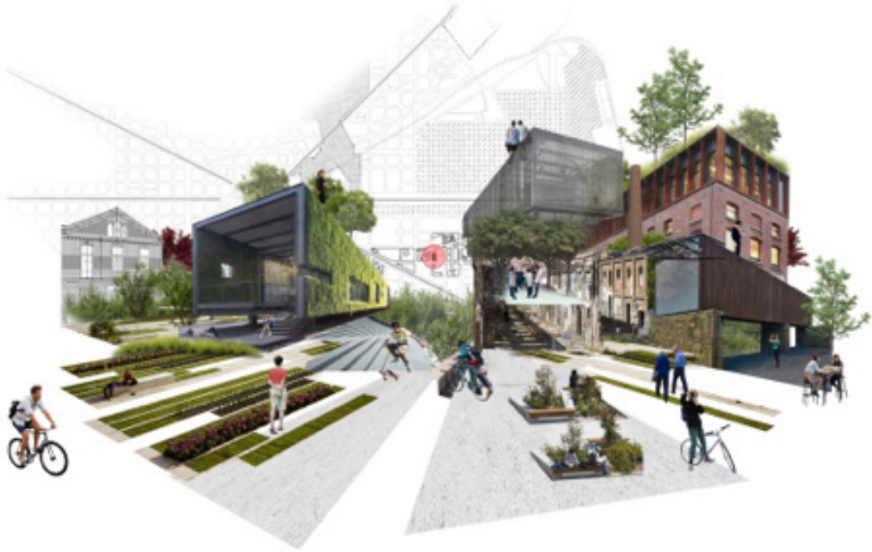
Figure 2: Student work by Yasmine Fahmy & Abdulkarim Umarov