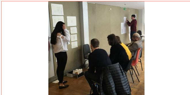
Figure 1. The crit in practice, Dublin School of Architecture, 2018

We consider that in practice, these ideals are in conflict with the reality of the student experience whereby the negative aspects clearly inhibit learning. Anthony talks about the physical barrier between the students and their classmates that is formed by the staff. Also, the same form of crit is used in the formative and summative assessment of the student's work. The crit model is time-intensive and often attended by students who are inattentive due to the repetitive nature of the presentations.