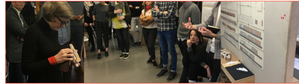
Figure 4. Red dot review day, Dublin School of Architecture, 2019.

Doidge and Parnell describe these broadly as student led discussions. They argue that a selection of a number of reviews are more likely to form a better learning example for the year in that it is less about the individual's work in turn and more about specific learning outcomes and problems that all the class encountered. The staff mark the pinned up work in pairs and separates the marking from the final review. The student gets marks and written feedback at the start of the day so as to aid their reflection.