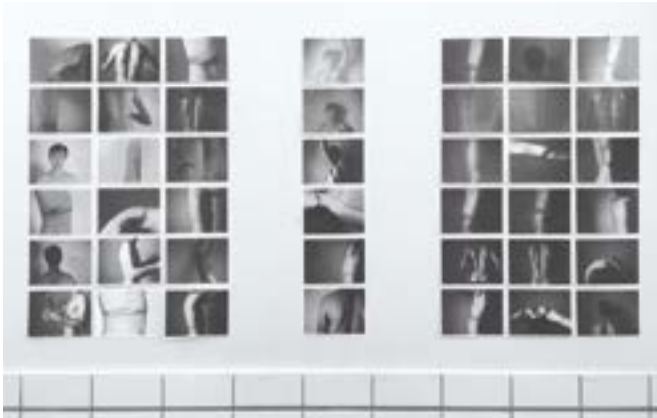
Figure 6. Example of presentation at the performative research exhibition

To conclude the elective we staged an performative research exhibition to share our conclusions in a gallery-like environment. The main purpose was to finalise and conclude the experiments and refine the objects and artefacts as an account of their research. We also invited some external jury members to evaluate the work. The exhibition was open for visitors and was seen as an open forum to discuss the work and the elective.