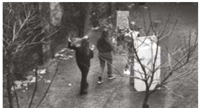
Figure 5. Example of choreographic object(ive).

As a last step the participants were asked to reflect upon their choreographic object(ive) in order to refine steps 1 to 3. The choreographic object(ive) could be based on lines, planes, volumes, movement(s), moving objects, projections, instructions, ... It was specifically stated that the choreographic object(ive) should avoid usefulness or functionality. Neither did it involve social science nor participatory design and it had to surpass the act of merely blocking someone or something. The participants were specifically asked to think about ways to augment the quality of movement - adding value to a situation or context as a design objective.