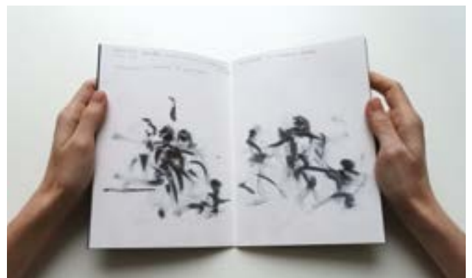
Figure 3. Examples of movement observation assignment (iii).