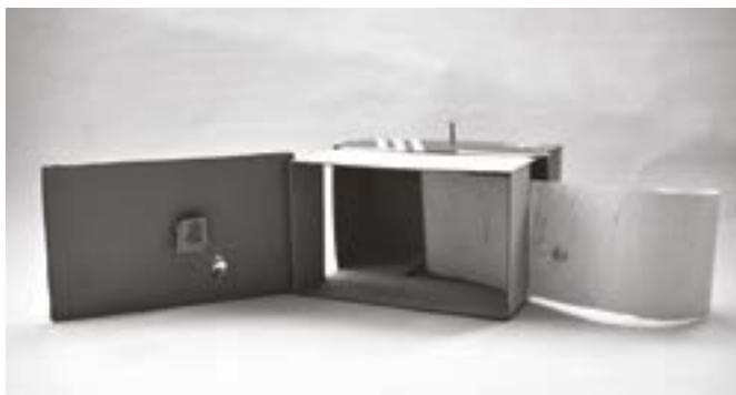
Figure 4. Example of a recording device.

The device intended to redirect the participants' attention to different aspects of movement and challenged them to assess and refine the device's ability to track movement graphically, aesthetically and even experientially. In evaluating the device's qualities the participants had to assess the resulting graphical notation in relation to the specific movement the device tried to track (i.e. velocity, change of viewing direction, destabilisation of gravity center, etc.).