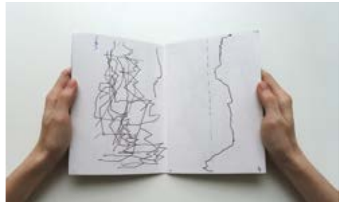
Figure 1. Examples of a recordings of a random walk (i).

participants to explore personal approaches in mapping movement and develop a personal movement notation system. These developed notation systems were reintroduced later in a design context (see 4.3).