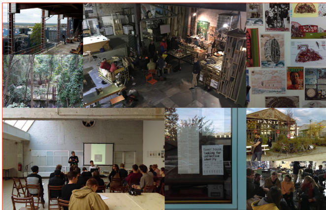
Figure 5. Fieldstation Studio, fieldtrip