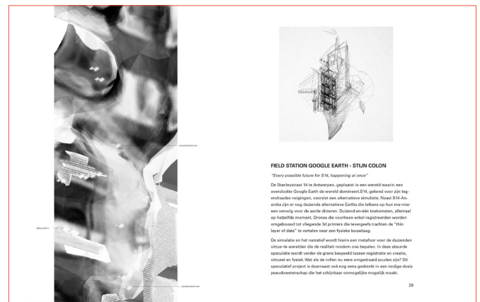
Figure 4. Hacking: Google Earth (Stijn Colon)

Students individually developed an architectural proposal for S14 in the second phase of the studio, further exploring and applying the ideas developed in the field guide.