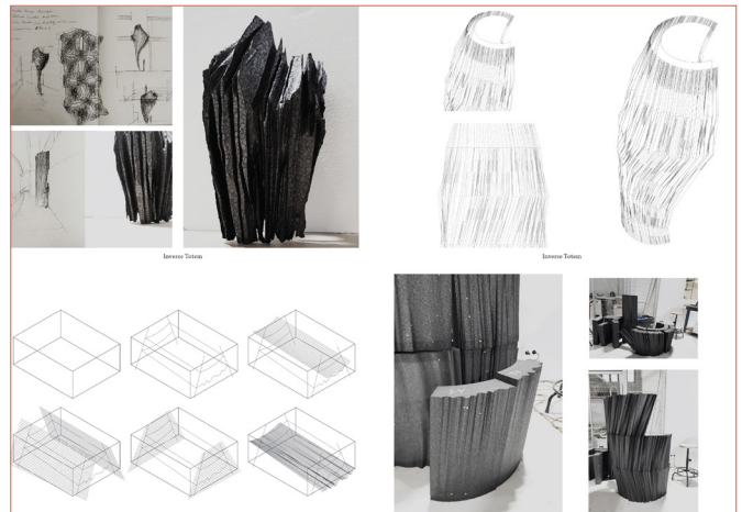
Figure 3. Unruly Surfaces , fabrication proces.