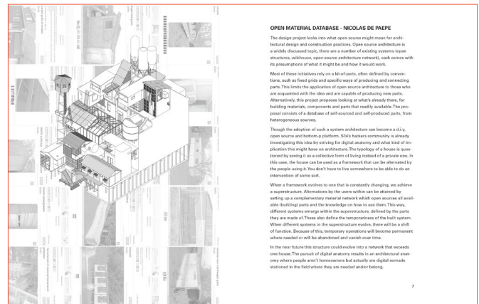
Figure 6. Hacking: Open Material Database (Nicolas De Paepe).

Fieldstation Studio aims to engage with the complex reality described above by rethinking our modes of operation and our position as architects designing embedded in this layered and hybrid environment. The studio investigates the potential of architecture as a medium to explore disrupt and raise questions rather than solving them. The studio proclaims that architects should proactively engage the complex reality of today rather than passively waiting for design briefs and projects. The design studio trains students in taking a position within contemporary fields and provides them with a platform for developing their future practice. Additional elective courses provide students with the necessary critical tools, skills and design media. The tools of choice are design fiction, spatial narratives, speculative media, imagineering, hacking and critical making. The studio operates as a collective practice, students are encouraged to actively participate in