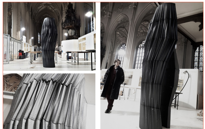
Figure 4. Unruly Surfaces , resulting installation.