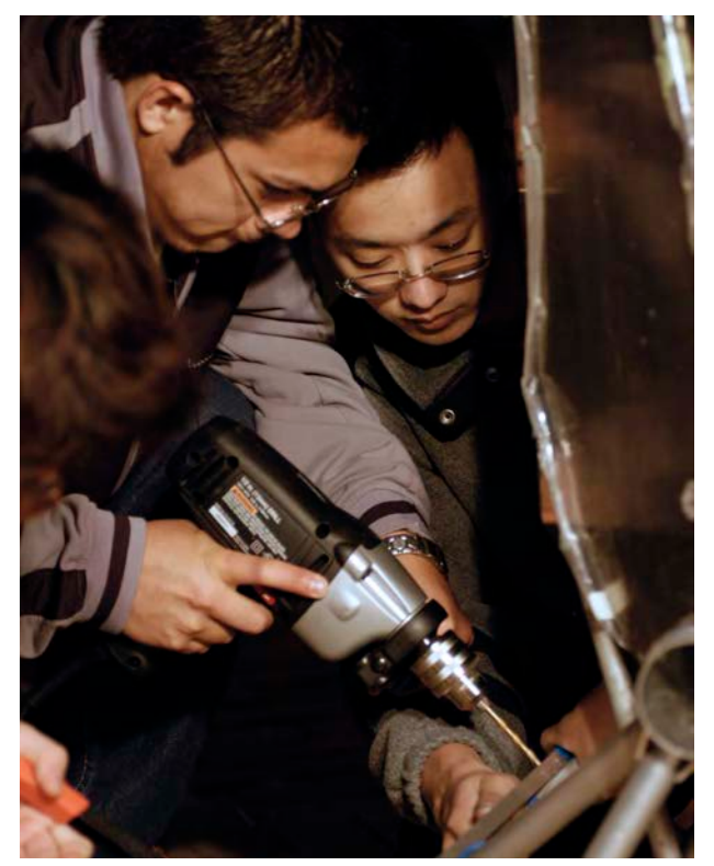
With shop support, undergraduates explore new tools and develop a deeper appreciation for craft.