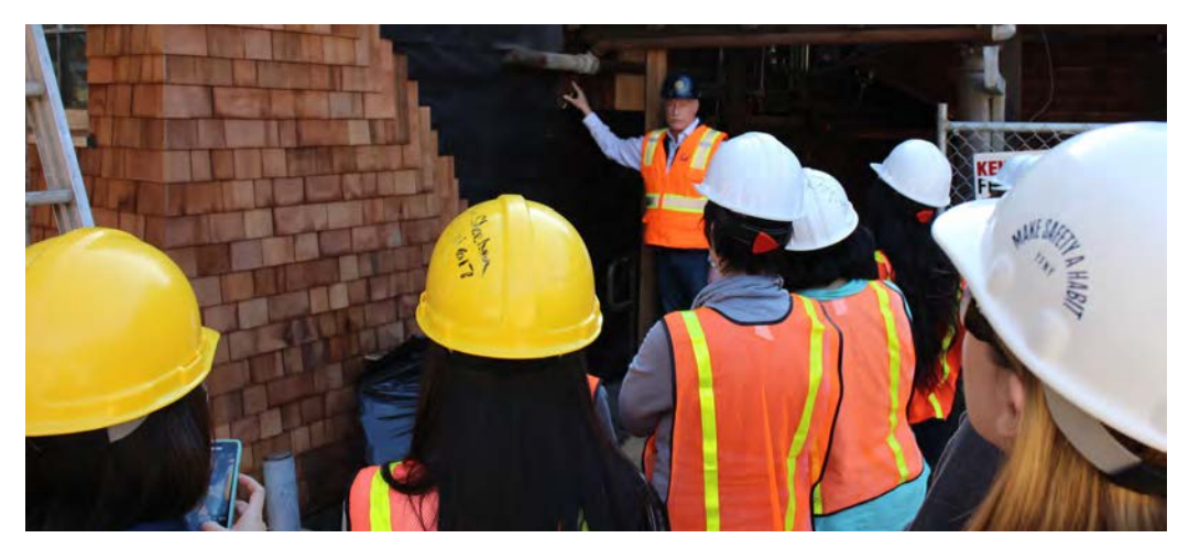
Students on site photograph and record what they hear, check vocabulary and concepts against lectures and the textbook, and write reports.