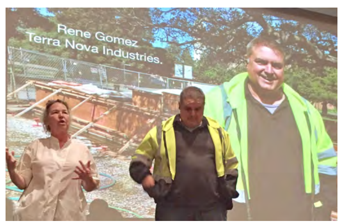
Superintendent overseeing work at Wurster Hall.