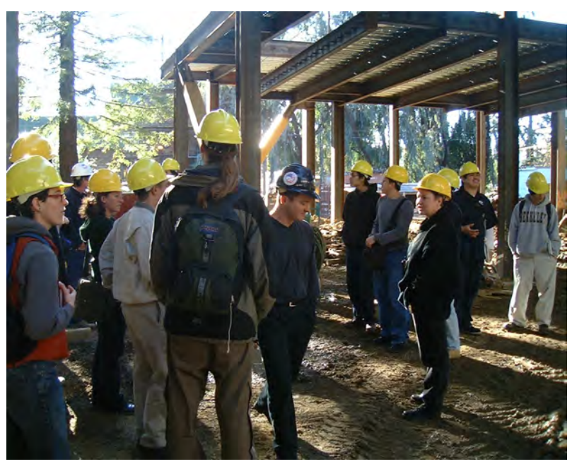
Superintendent (in blue helmet) and I with students on site in 2007; note the buckling-resistant braces (BRBs), then novel, in the background.

Too often, construction is something within the architectural curriculum to be suffered and soon forgotten. Evaluations frequently identify my "Introduction to Construction" classes, though, as students' favorite; we take into account students' values and interests and embrace the construction industry's complexity.