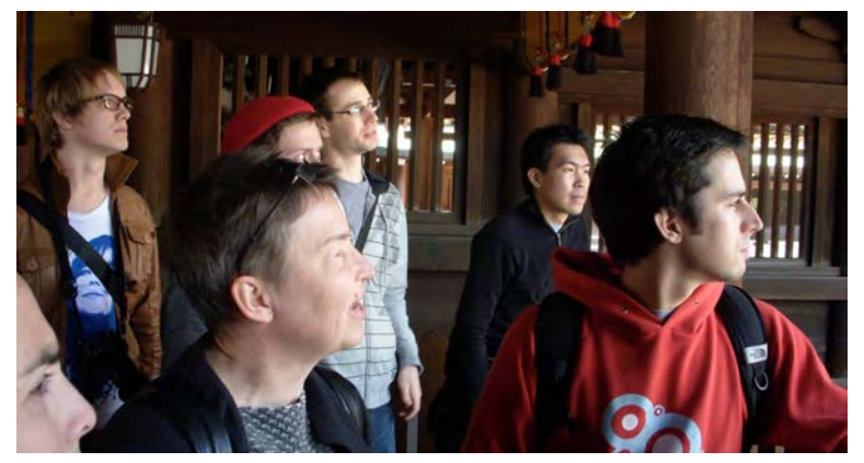
With students at Meiji Shrine.

Since 2001, as resources and opportunities were available, I've arranged for many graduates and undergraduates to interact critically with Japan's AEC industry.