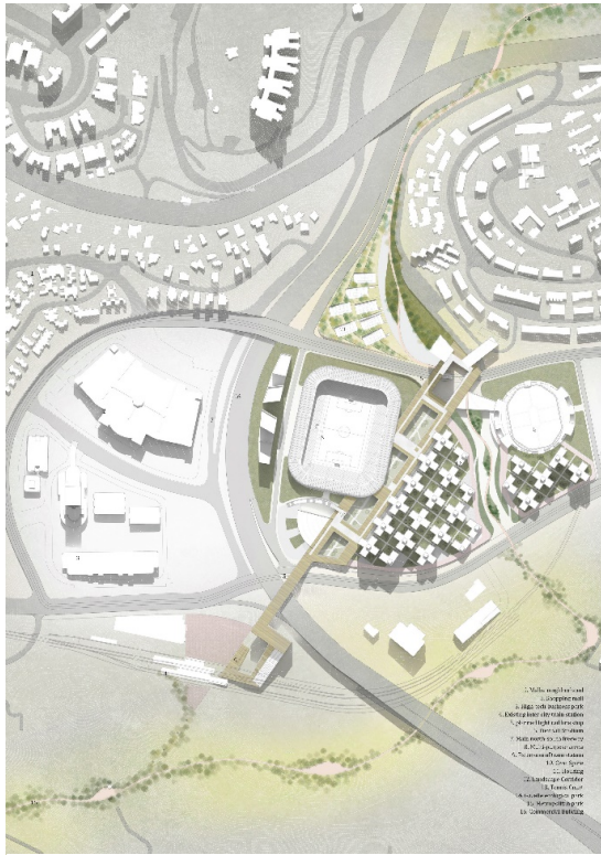
Figure 2. Analogy of the Old City.