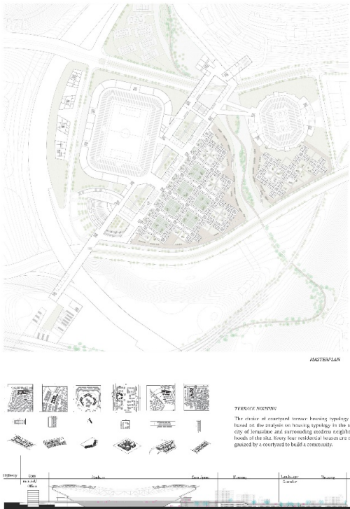
Figure 3. Reframe Civic Life.

THE CIVIC SQUARE The Civic Square is the centerpiece of the project, as the most critical public space. As the infrastructure of the project, it links the stadium and the arena, and several other public services for convenience and vitality, including a co-dominant church, a hotel, a library, a retail hub, a kindergarten, a day care center, a theater, and a commercial complex. ANALOGY OF OLD CITY The project borrows spatial and architectural elements from the old city. The composition of housing, office buildings, retail and recreation in the background could be regarded as the analogy of the composition of Mosaic Old or Old city.