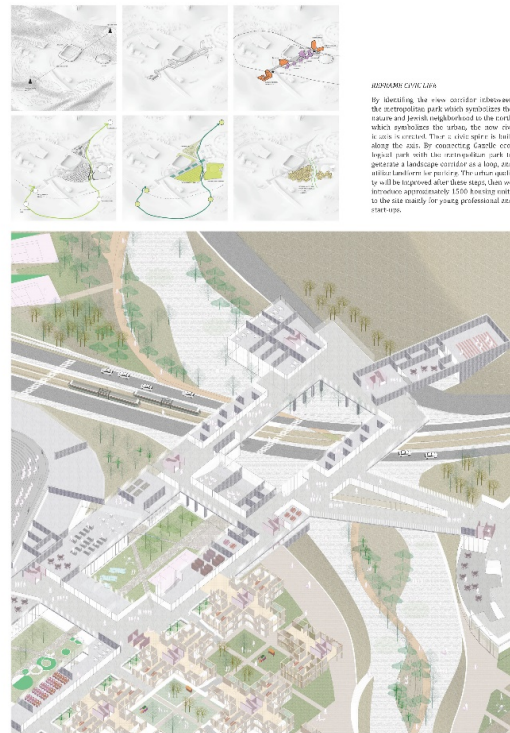
Figure 1. Redefine In-Between Space.