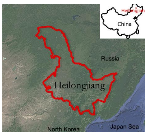
Figure 1. Location of Heilongjiang Province.

Heilongjiang is the province with the northernmost, easternmost, highest latitude and easternmost longitude in China. It is located at 43° 26' ~ 53° 33', 121° 11' ~ 135° 05'. It is 1120 km long from north to south, 930 km wide from east to west, covering an area of 473000 square kilometers. A location map of Heilongjiang is shown in Fig. 1. Heilongjiang is China's heavy industry base, with machinery, oil, coal, wood and food industries as the main industries, and it is rich of natural resources, including minerals, forestry, energy, land, animals, plants, water resources, etc. It is the largest grains production base in China. The strategic position is very important.