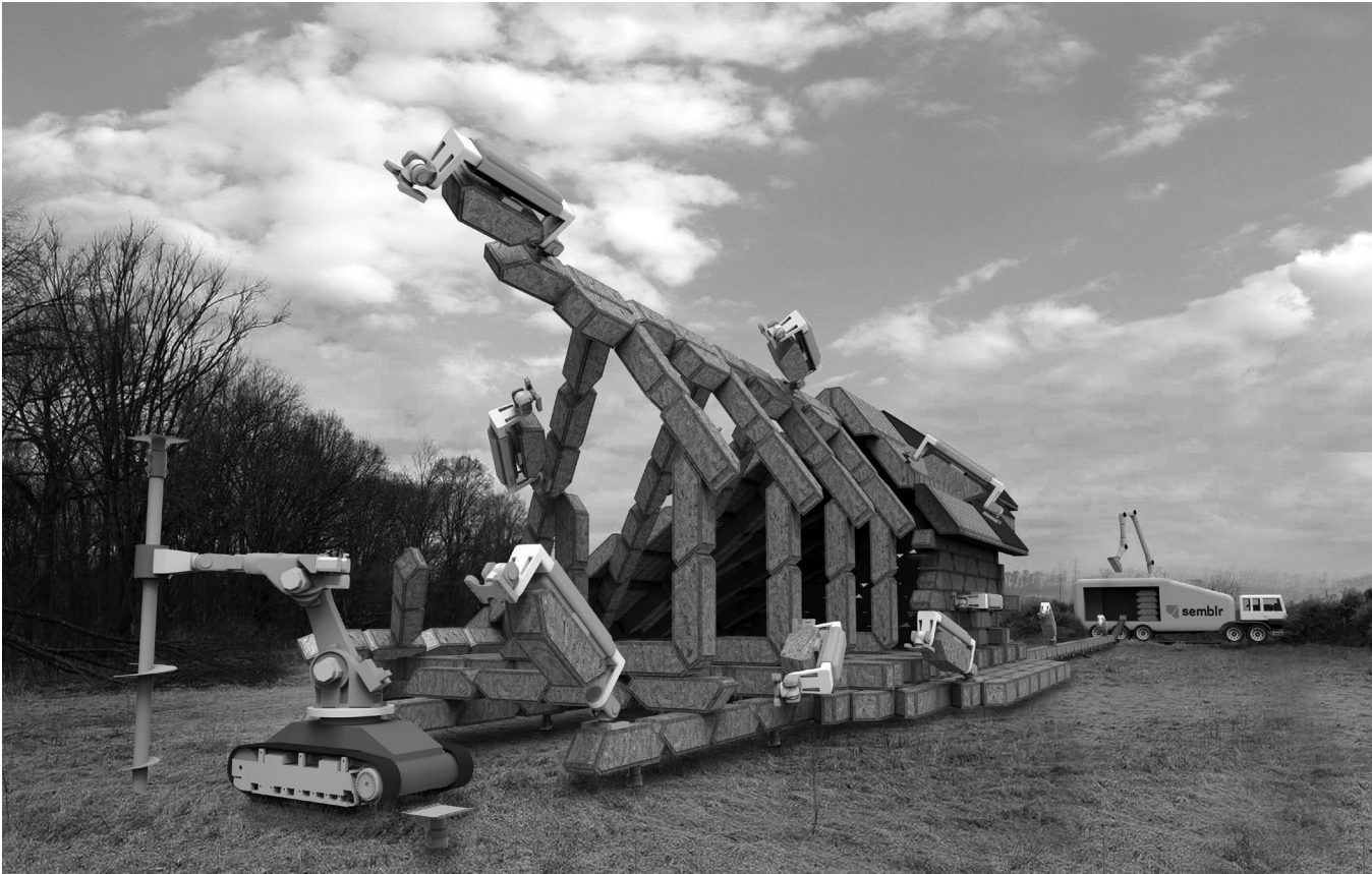
Figure 3: Autonomous semblr robots assembling housing structure. Ivo Tedbury, Unit 19, Design Computation Lab, 2017.

to these building blocks as ‘voxels’, or a three-dimensional pixel. The concept of the voxel is related to Neil Gershenfeld’s concept of ‘digital materials’. Gershenfeld, from the Centre for Bits and Atoms at Massachusetts Institute of Technology, recognised that while fabrication technologies are embedded with digital logics, materials were analogue. A digital material “assembled from a discrete set of parts, reversibly joined in a discrete set of relative positions and orientations.” 9 What digital materials enables is logic of connectivity between each discrete part in a ‘kit of parts’. Each voxel therefore physically and virtually has a male-female connection which is the equivalent of the 0 and 1 in digital data, similar to Lego (figure 2).