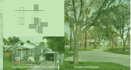
EXISTING NEIGHBOR BUILDING / MODULE

SITE + LANDSCAPE EXPANDED GREENSCAPE WITH PATHWAYS AND COURTYARDS