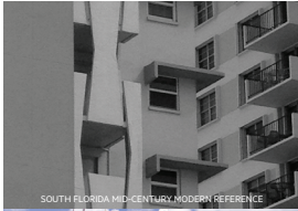
SOUTH FLORIDA MID-CENTURY MODERN REFERENCE

CLIMATE SENSITIVITY PASSIVE COOLING STRATEGIES, SHADE, CANOPY