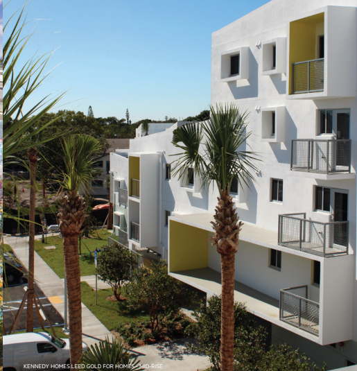
KENNEDY HOMES LEED GOLD FOR HOMES - MID-RISE