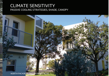
NORTH FACADE ALONG BROWARD BLVD.

CLIMATE SENSITIVITY PASSIVE COOLING STRATEGIES, SHADE, CANOPY