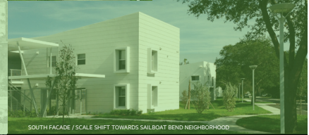
SOUTH FACADE / SCALE SHIFT TOWARDS SAILBOAT BEND NEIGHBORHOOD