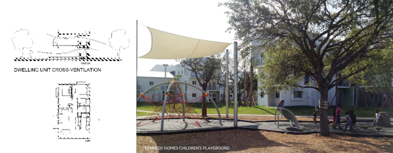
DWELLING UNIT CROSS-VENTILATION