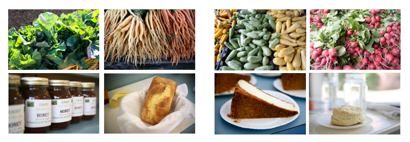
Local produce and café products