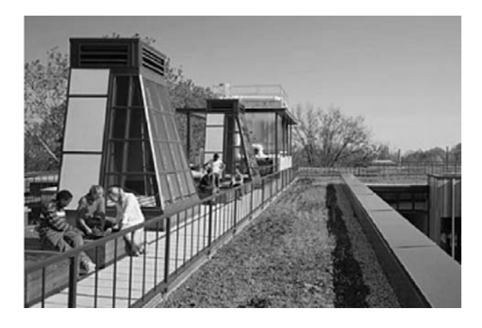
Figure 6. All systems and elements are exposed and accessible to the students as a learning textbook at Sidwell Middle School.

Sidwell Friends Middle School weaves together a renovated existing building with a new recycled cedar-clad building, surrounding a constructed wetland courtyard. Wastewater is processed through the terraced wetland, which acts as a biological filter. The children have prepared video documentation of this process for their school's website.<sup>36</sup>