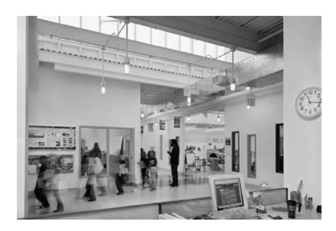
Figure 7. The open and light classroom spaces with the saw-tooth skylight additions of Bronx Charter School help transform this meatpacking factory into a vibrant elementary school in an industrial area.

The interior is filled with color and light from six saw-tooth skylights in a complete reconstruction of the roof. The scale, openness, detail and materiality of the Bronx Charter School for the Arts reflects a changing understanding of what educational facilities should and could be, as well as an openness to experimenting with the architectural form.