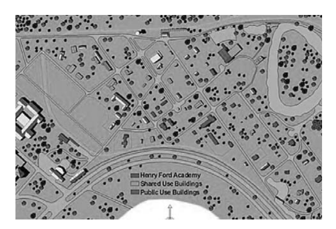
Figure 8. The Henry Ford Academy is located in the interactive Henry Ford Museum, taking advantage of the institution's rich resources for hands-on, experiential learning.

The creation of the Henry Ford Academy on the campus of the Henry Ford Museum blurs the line between school and museum for its 450 students. The Academy leads students to explore the world through the lens of the museum collections, setting them free on a 90-acre site that includes 82 historic buildings. Students investigate places such as Thomas Edison's laboratory and the Wright Brothers' bicycle shop as part of their project-based learning. They learn in a way that is engaging and interactive, and teaches them about how a cultural institution is run. Spaces at "the Henry Ford," as the museum is known, are non-traditional; a student center created in a building formerly housing a carousel, multi-purpose spaces carved from a railroad depot, and railroad cars used as classrooms. Henry