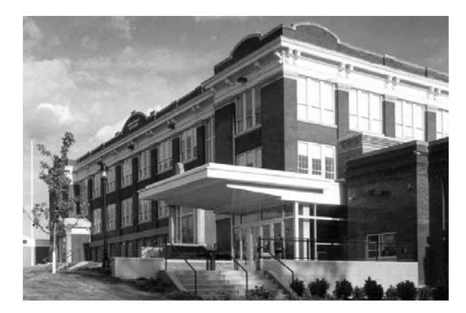
Figure 10. John A. Johnson Achievement Plus Elementary School receives the Medal of Excellence as the best example of a school that is the center of its community.

John A. Johnson Achievement Plus in St Paul's East Side neighborhood is an elementary school of 350 students. It represents a unique public-private partnership with school, recreation, and community services all located in one convenient place. Achievement Plus provides "extended learning" op-