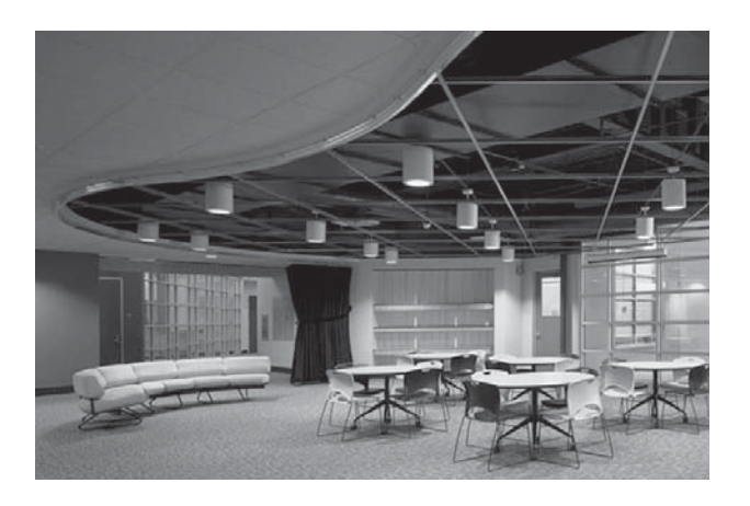
Figure 1. This flexible studio space at the center of the classroom cluster in Denver School of Science and Technology illustrates the school's multiple and varied spaces for learning. (Source: Klipp Architects)

Denver School of Science and Technology (DSST) is a 65,000 square foot middle and high school designed to create multiple spaces for learning. The "Commons" is a double-height, open gathering space at the entry, with administrative offices located adjacent to it. Classrooms of different sizes and types are organized in clusters and arranged by grade level. Each classroom cluster centers on an open studio that serves as a flexible space for team presentations, informal meeting and integrated learning activities. A shared office space allows teachers to work together when planning lessons in cross-disciplinary teams.