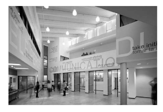
Figure 3. The welcoming entry and open area at the heart of the wedge-shaped Perspectives Charter School illustrate well the concepts of access control, natural surveillance and territoriality.

Perspectives Charter School, located in a lower-income neighborhood of Chicago, is designed with a circulation core at the hub of a double-stacked layer of classrooms, administrative offices, and support areas. Perspectives is an interior courtyard building with the main shared space used as a multi-purpose "Commons." The walls of this two-story space convey the school's core values. Surrounding the Commons is circulation on both floors, providing numerous overlooks and alcoves. Clear visibility into the school's various spaces provides informal surveillance and aids in wayfinding. <sup>22</sup>