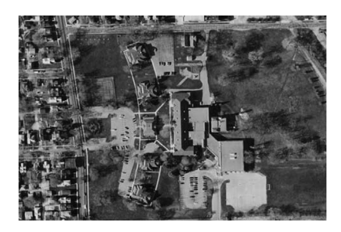
Figure 4. The campus-style environment of Imagine MASTer Academy in Fort Wayne, Indiana organizes the school's academic program into small semi-autonomous schools.

The directors of Imagine MASTer Academy in Fort Wayne, Indiana are working with architects to create a "cottage feel" for the seven campus-style buildings of their K-8 charter school, located on what was originally a Catholic orphanage. The campus layout gives MASTer Academy the opportunity to organize into semi-autonomous small schools, clustering classrooms, teacher's offices, project rooms and flexible use spaces within each building. To create learning communities, faculty and administrators are exploring ways to group students that offer them the best opportunity to gain a rich learning experience. This may mean splitting subject areas by gender, developing multi-age level groups, looping (allowing students to return to the same teacher), or creating advisory teams (a core group of students working with an adult mentor).24 Within each "schoolhouse," a dedicated space is provided for students as a "home base."25 The campus environment, with landscaping, paths, edges, and outside interaction spaces, engages the whole school as a community of communities.