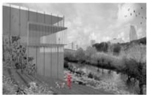
FIG. 4 Images of the Socle Mat: The constructed landscape of the socle replete with water filtration and public space systems, multistorey landscape infrastructures that support community infrastructure programmes, and specific program nodes as points of formal entry into the ravine system.