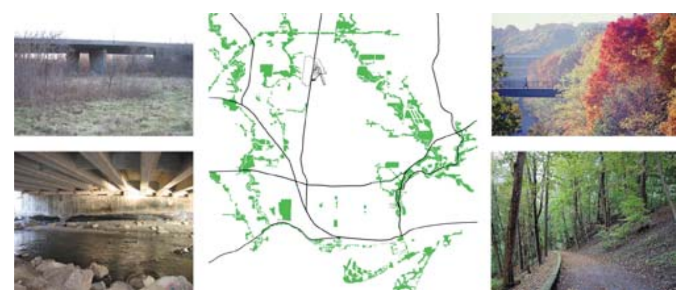
FIG. 1 (centre) Plan of Toronto illustrating the presence of the ravine system and its interconnectivity with other informal ecologies -the Don River on the East, and the Humber river to the West (right) images of the official: Don ravines and its crossings, (left) the Humber ravines as residue - surficial and internal conditions.

The ravines of Toronto constitute a specific type of urban space, as whilst they might physically and psychologically occupy a condition of terrain vague,<sup>5</sup> they are also latent with geological, physiological and mythological presences and rich