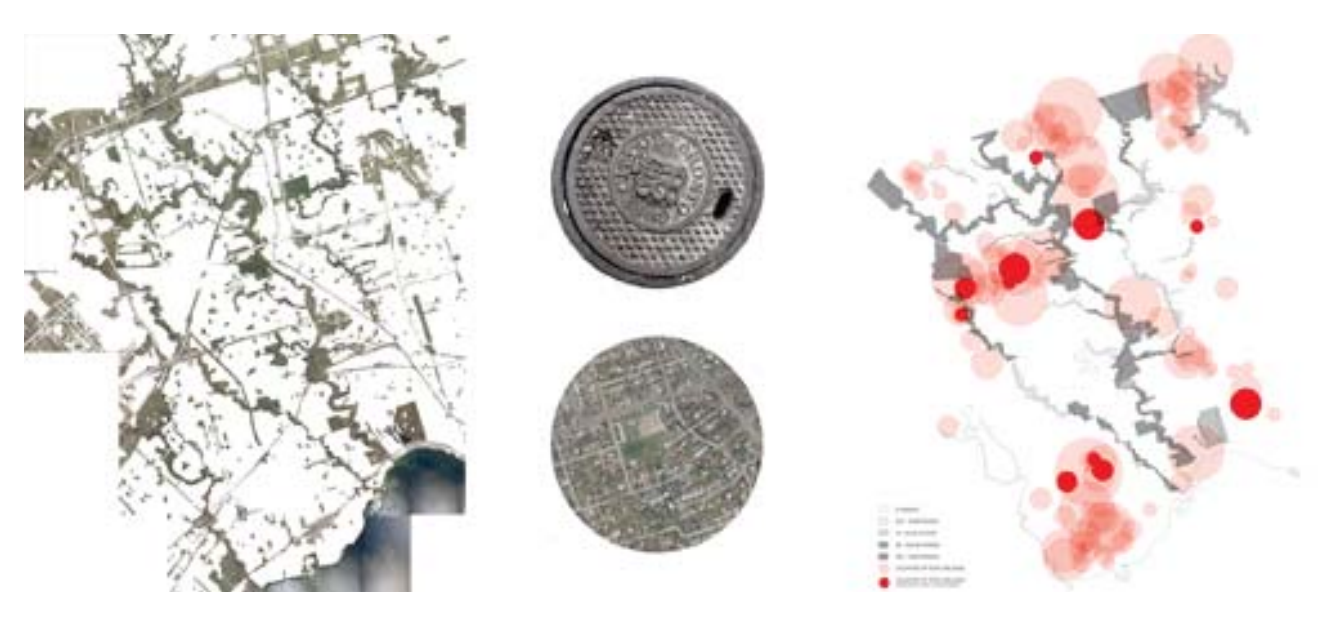
FIG. 2 (left) Erasure mapping indicating Humber Watershed figure relative to adjacent networked ecologies associated with rail, highway and hydro infrastructures. (middle) catalytic systems: stormwater and centre-centric platting patterns locate dense housing at the ravines margins and fuel the flow of contaminants into the ravine system (right) Mapping of carcinogenic contaminant release sites into adjacent soils.

During the 1950's and 60's, market-based highrise housing was constructed on numerous sites adjacent to the ravines as part of a great boom of residential growth within Toronto. Although these structures were given a remarkable proximity to the ravine system, their location was actually considered to be on the periphery relative to central-