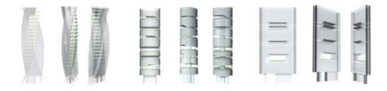
FIG. 5 (left to right) Three tower typologies proposed within the Ravenous Urbanism framework. Within tower mass, a variety of unit sizes and tenure types are accommodated including vertical greenhouse spaces and terrarium types with photovoltaic skins, and turbine types that generate energy to drive public amenities in vertical configurations, or at the space of the socle landscape below.

Whatever one thinks of this vision, it is clear, that in attempting to address the complexities of natural systems within urban contexts, much more is at stake than the provision of quantities of "green". For most industrialized North American cities, such ecological systems have been suppressed within the field of urban morphology that surround their figure. What is of great interest in the Toronto example, is that highly particularized cultural and demographic conditions attend these territories - conditions that, if not already constituting urgent territories of action, will become increasingly potent site for intervention as urban densification continues. Within the Canadian example, an astonishing array of policies attend the introduction of development mechanisms that, if implemented, may in fact provide the political