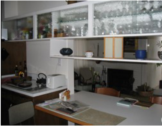
Figure 3. Kitchen and living room.

two earliest residential leaders of the HPOZ movement in Mar Vista were women. While both men and women have over time been equally engaged in the preservation process, the women frequently describe their motivation as based on a desire to preserve aspects of the neighborhood they feel impact the quality of their daily lives within their domestic environments (e.g., privacy, viewing, and interaction opportunities). Conversely, the men interviewed describe this sentiment less frequently than they describe their desire to create a more lucrative investment through HPOZ status, or to preserve the homes as objects of value or attachment.