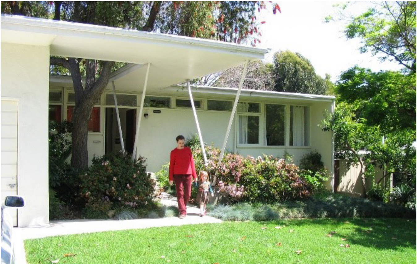
Fig 2. Front Exterior

their belief in the productive power of creative practice. Using similar strategies as Ain and Eckbo, they were invested in stimulating viewers' perceptual experience through their artwork, with the intension of increasing viewer's capacity to look and think deeply. Susan Sontag wrote in 'Against Interpretation', "Ours is a culture based on excess...the result is a steady loss of sharpness on our sensory experience. Our task is to cut back on content so that we can see the thing at all." Artists such as Sol LeWitt and Eva Hesse, believed that to increase viewers visual experience, artists needed to provide them with reduced visual stimuli, contrasting the norm of commercial culture. 10 Ain's homes follow this formula in their geometric simplicity, demanding more output and interaction from the viewer, and in exchange giving them the opportunity to expand their subjective capacity.