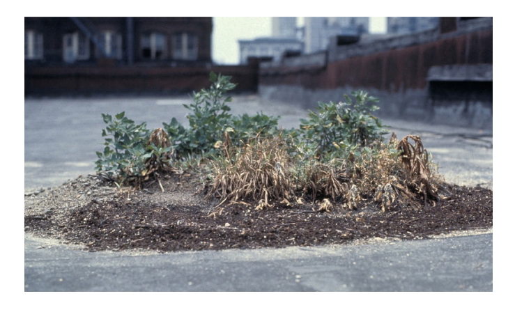
Figure 3: Hans Haacke Bowery Seeds

endeavor. Grosse's previous monumental works of "painting" combined multiple hues that dematerialize the figure and form of its various substrates: including beds, walls, soil, or large shards of cut polystyrene. In psychylustro , the hues are separated by hundreds of feet, yet they meld in time, as the fluorescent paint occupies the rail passenger's retinal after-image before encountering the next pulse of lurid green, orange, then pink. It touches on op art: solid color is transformed into a work of colored light. psychylustro is a landscape; it is a landscape painting, and a landscape painting <sup>9</sup>. Unlike typical murals, psychylustro lacks figures, allegory, message, sentiment, nostalgia nor obvious optimism.