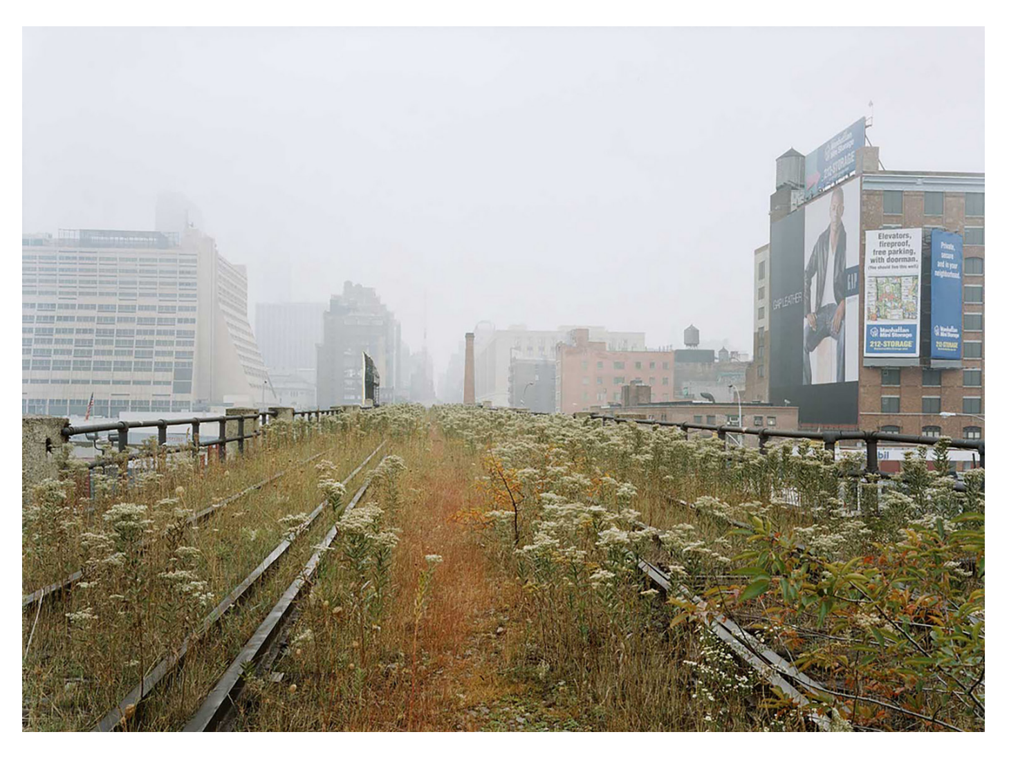
Figure 4: Joel Sternfeld. High Line, Looking East.

Ruderal occupation is the subject of much contemporary landscape photography—often called "ruin porn"—published in folios such as Joel Sternfeld's High Line images (fig. 4), photographers Andrew Moore ( Detroit Disassembled . 2010), Camilo Jose Vergara ( American Ruins , 1999), and James Griffioen ( Feral Houses, Lost Neighborhoods , 2009). These images play on the oscillation between pathos of abandonment and the riotous optimism of the ruderal vegetation occupying the ruins.