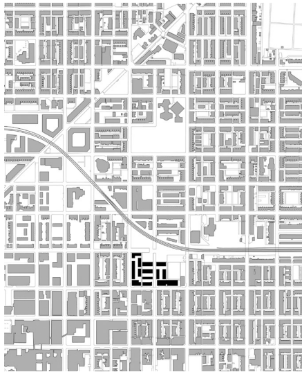
Figure 3: Henderson-Hopkins School

Graduate School of Education (HGSE) in the Spring 2012. 19 The seminar brought together the GSD and HGSE students in order to test and observe how these two groups collaborated in the predesign stages of a brief theoretical project, focusing on an existing 600-student, K-8 turnaround school within the Boston Public Schools (BPS).