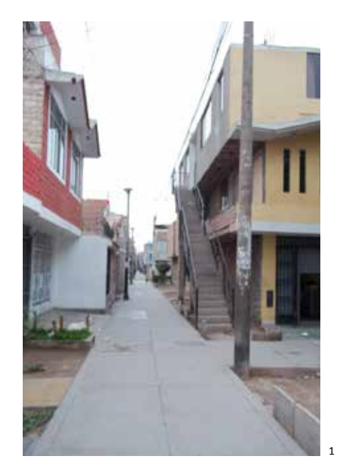
Figure 1: PREVI, Lima, Photograph by author, July 2013.

A visit to the PREVI housing complex today will reveal a relatively inconspicuous neighborhood, tucked away in the northern end of the Lima - appearing no different to the untrained eye from the generic ubiquitous buildings that occupy this part of the city. Yet the 'Proyecto Experimental de Vivienda' (Experimental Housing Project) has been variously described by architects and architectural critics as the "last great modernist social housing project"; "A Peruvian Wissenhofsiedlung"; "the coitus interruptus of social housing in the Third World"; "A Metabolist Utopia"; "A successful failure" or the moment when "attempts by avant-garde architects to help overcome a housing deficit came to an end." This last description of the project, a telling verdict, comes from PREVI's project director Peter Land who was also its chief master-planner. <sup>5</sup> PREVI Lima was the ultimate socialist dream of Peruvian President Fernando Belaúnde Terry. Himself an architect - Belaúnde sought a final architectural 'solution' to the crisis of mass housing that had reached a stalemate in Peru of the 1960's plagued with an endemic influx of migrants to Lima.<sup>6</sup> To better address the housing deficit,