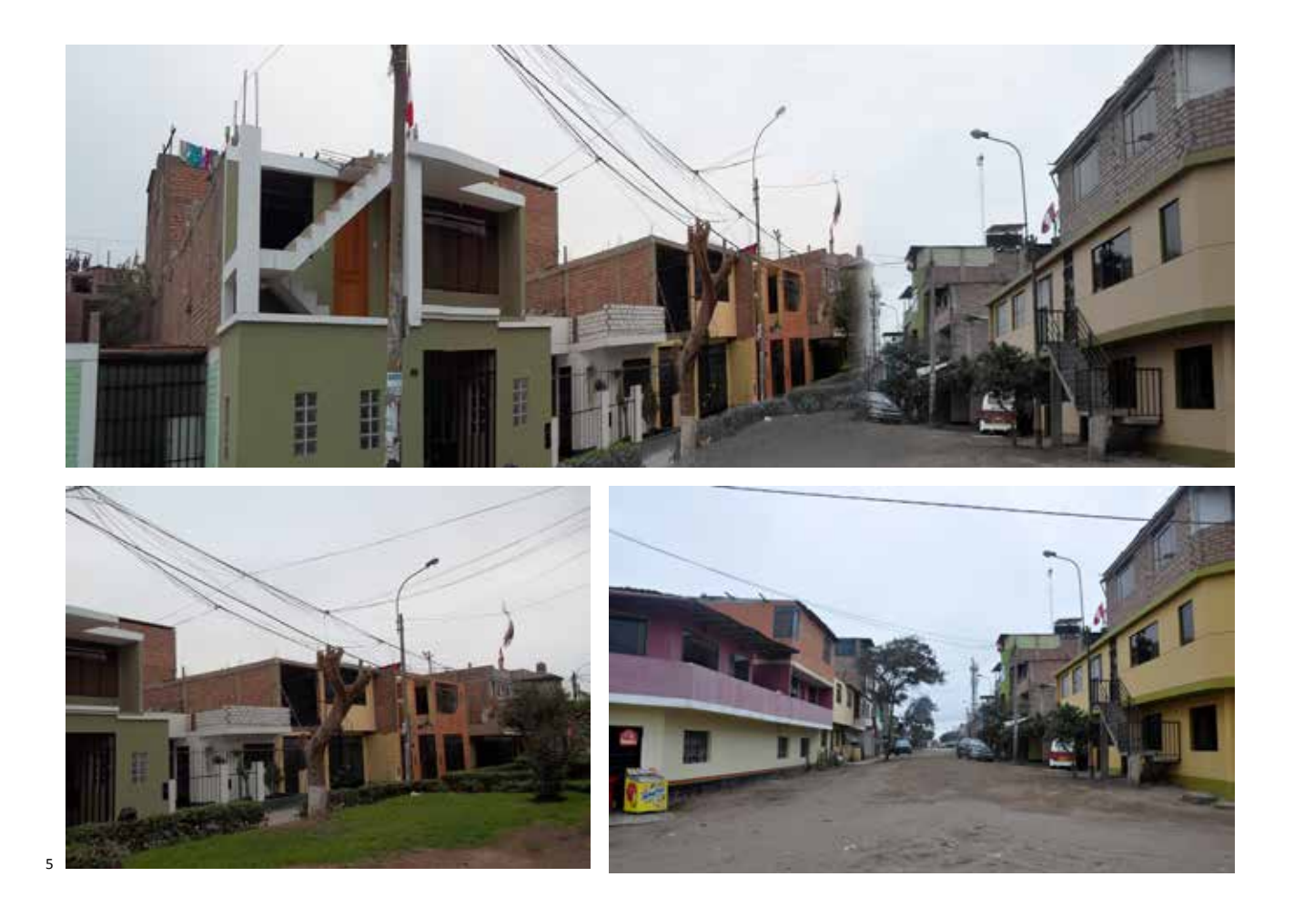
Figure 5: The image on the top of the page is in fact a collage of two totally different settlements photographed by the author - the left being PREVI, Lima and the right being Villa El Salvador. The contemporary conditions of these neighborhoods makes it impossible to decipher their diametrically opposed origins.