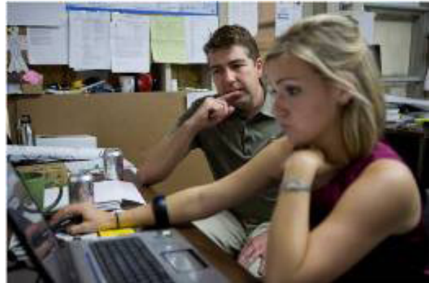
Figure 3. Author and student assess project budget for solar decathlon.