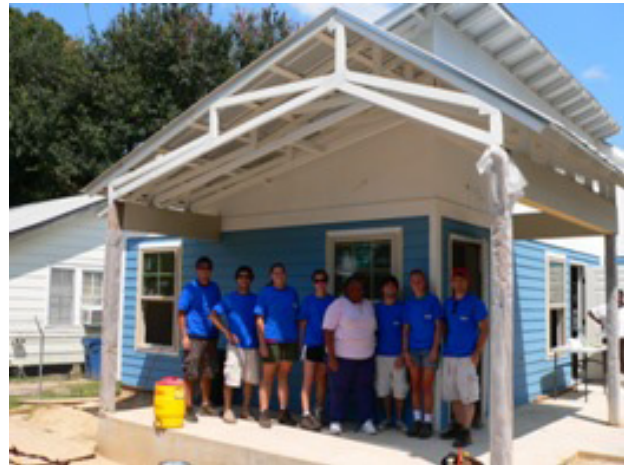
Figure 5. UL Lafayette students at a collaborative Habitat for Humanity Project with their client.

Finally, based on recent experience (a topic for an upcoming article), 31 the author recommends that design/build programs partner with community