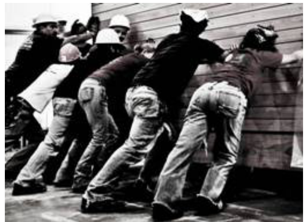
Figure 1. UL Lafayette students push solar decathlon home out of fabrication warehouse.

A frank discussion should occur within schools of architecture regarding the value of design/build. Structural deficiencies have to be addressed. And ultimately best practices must be established and enhanced with new models explored in order for design/build programs to be sustainable in these challenging economic times.