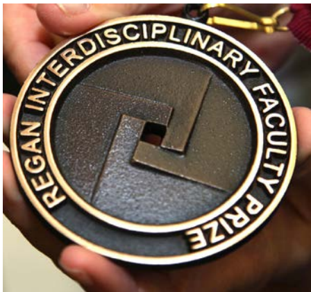
ACSA Counselor and Architecture Professor earns 2016 Regan Interdisciplinary Prize.