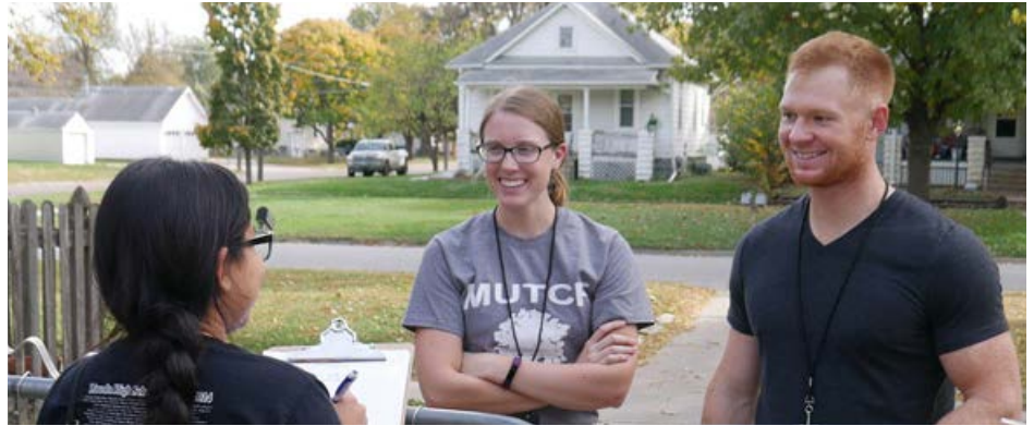
University of Nebraska’s CRP Studio Is Making a Difference in Lincoln Neighborhoods.

years from doing just scans of properties, expanding to include resident surveys and public meetings. I hope we can continue to build on this process so that future University classes can build on what the previous classes have done.”